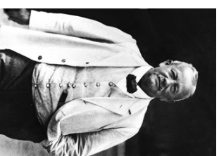
Company founder Karl Kömmerling

Decades of know-how are incorporated in the window system production operations and we soon evolved into a leading systems supplier. The latest system generation of KÖMMERLING 70 with chartered or oval detailing sets unique standards of performance in a PVCu window. It incorporates our comprehensive expertise, decades of research and development work, state-of-the-art CAD and 3D computer modelling and countless tests. This revolutionary window system reflects our commitment to offering best-in-breed products for our customers.